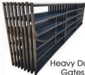
Heavy Duty Gates 5, 6 & 7 Bar