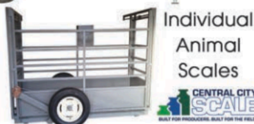
Individual Animal Scales

CENTRAL CITY SCALE BUILT FOR PRODUCERS. BUILT FOR THE FIELDS.