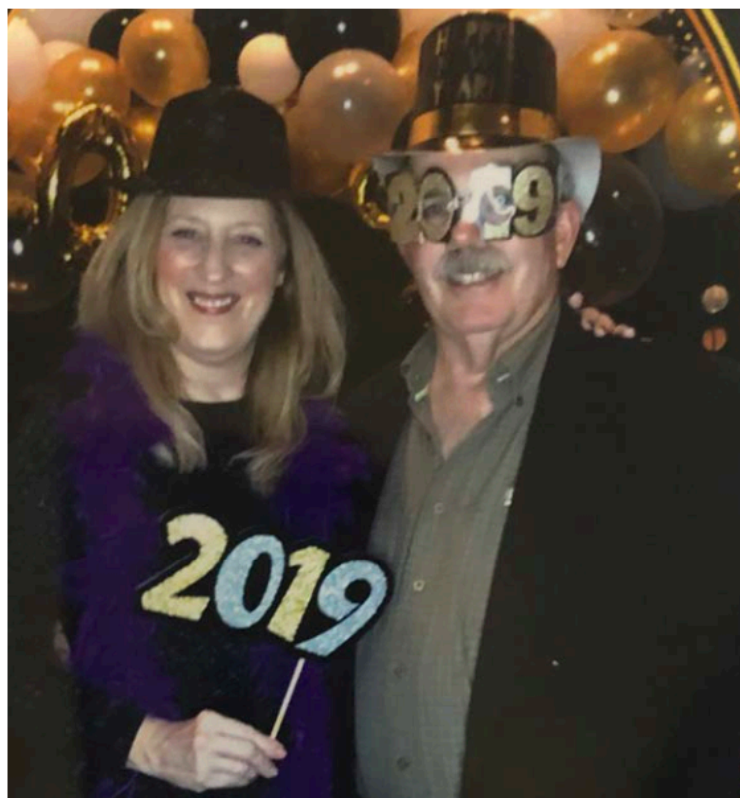
New Years Eve 2019.