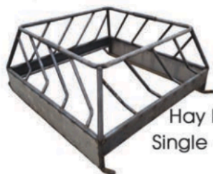
Hay Feeders Single & Double